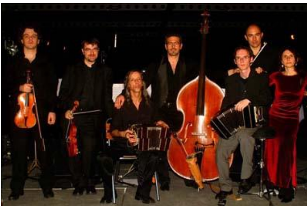
Show ConcepTango Friday 21.30